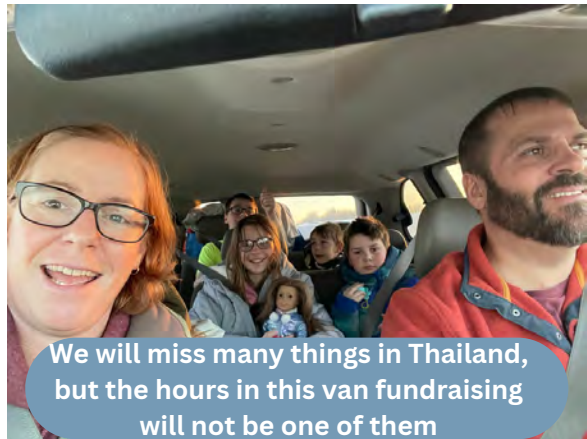
We will miss many things in Thailand, but the hours in this van fundraising will not be one of them

Staying regularly connected while in Asia