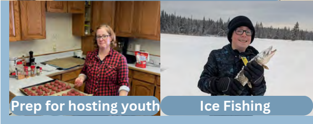
Prep for hosting youth