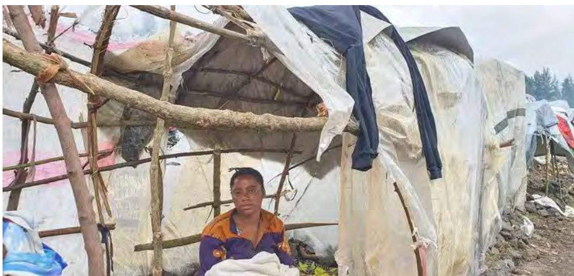
Families in Kivu province, DRC, staying in makeshift tents while they wait for the turmoil to end. They are so thankful for the food relief that will help them survive.