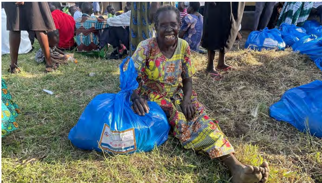
Food relief packages distributed in Uganda's northeastern region